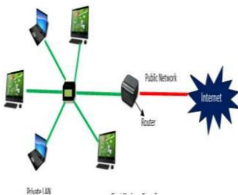
Fig 1: Hardware Firewall

A. Hardware firewall: It provides security to a local network, Hardware firewall is typically part of TCP/IP router.